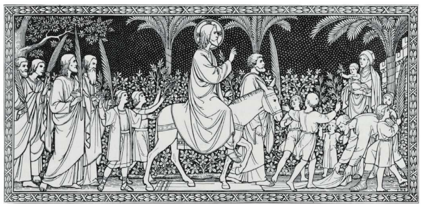
Image: Dominica in Palmis by Unknown, 1935 Missal

"Hosanna! Blessed is he who comes in the name of the Lord! Blessed is the kingdom of our father David that is to come! Hosanna in the highest!"" - Mark 11 9-10