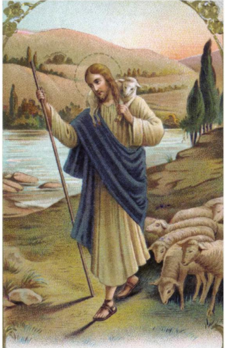
Image: The Good Shepherd by Bouasse-Jeune Publishing Spanish Digital Library, Public Domain