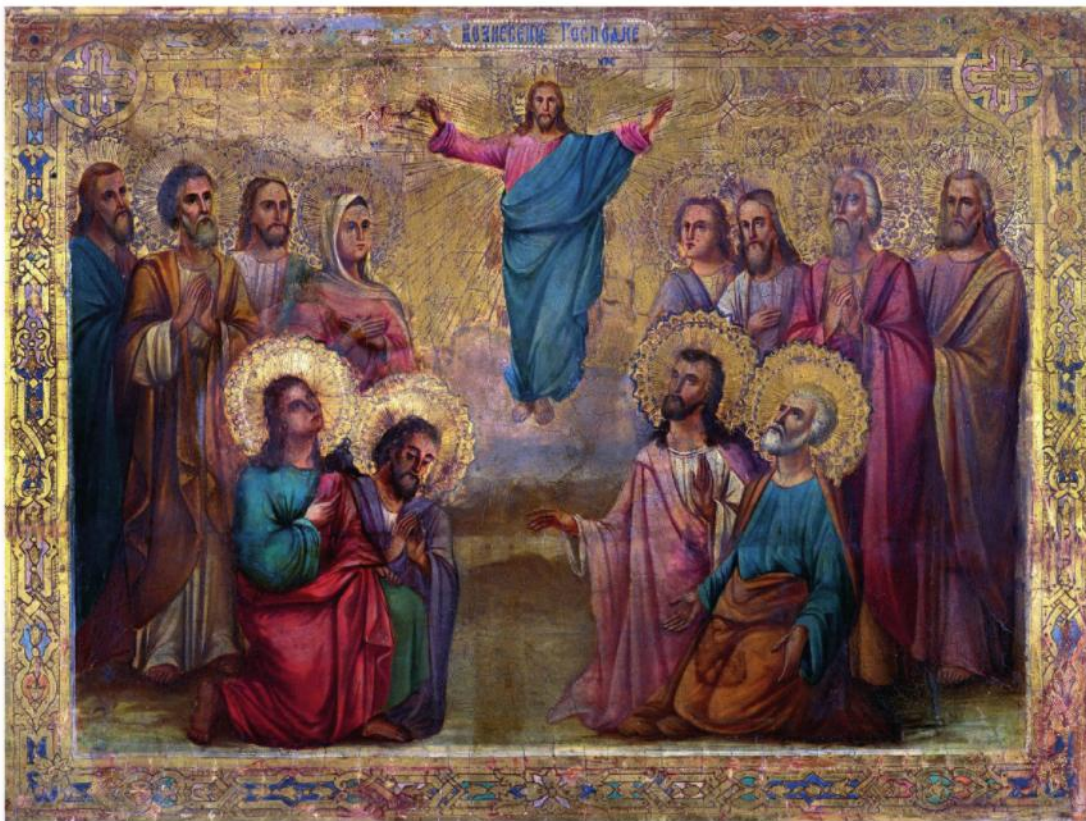
Image: Ascension of Christ by Unknown, Silesian Museum, Public Domain

"Go and teach all nations, says the Lord; I am with you always, until the end of the world."